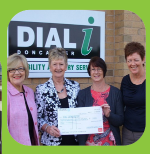
DIAL receives a donation from Doncaster Ladies Choir