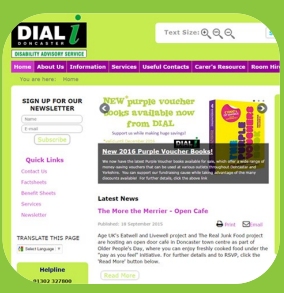
Website is upgraded