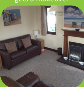
Blackpool holiday lodge gets a makeover