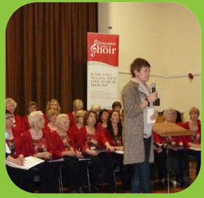
Doncaster Ladies Choir hold Christmas Concert in aid of DIAL